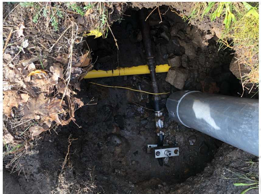
Very critical that we keep a good clean working space around the piping. The vacuum truck has been a great tool in keeping tidiness.

All of the water from the wells is chlorinated/disinfected to ensure safe drinking water for the community. Total capacity from the wells at maximum production is over 3.5 million gallons per day and the peak summer demand is approximately 1.7 million gallons per day so the District has very adequate source water reserve capacity.